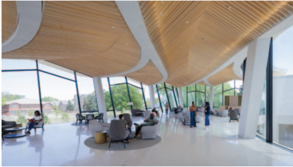
The new Cultural Living Room at the Arkansas Museum of Fine Arts.